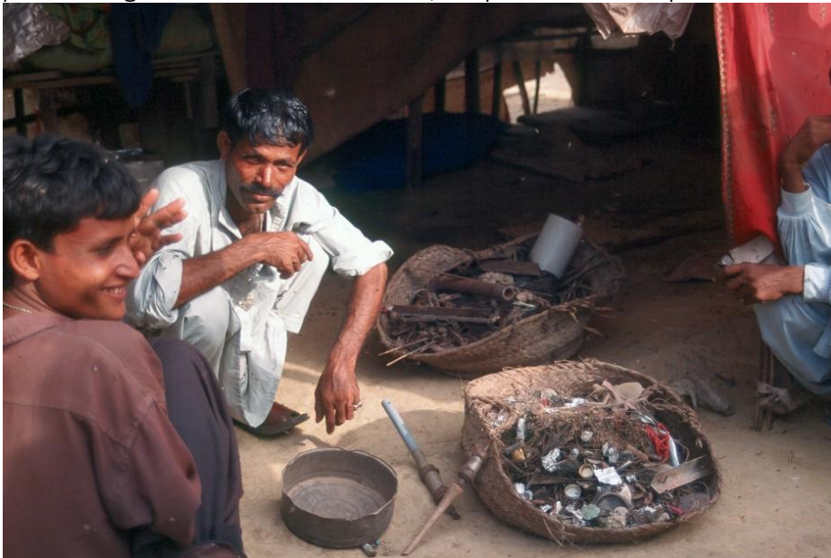
Photo 2: Recyclable materials dealer in Pakistan.

Many cities have active recycling sectors. This is predominantly an informal-sector activity, and can provide employment for tens of thousands of urban poor in a single city (photograph 2). Where the sector is particularly well developed, influential businessmen may have vested interests in retaining control. Efforts of SWM planners may be best directed at regulation and support: for example ensuring recycling workers are properly protected from health and safety risks, and that businesses access recyclable materials as close to the point of generation as possible (e.g. collected from households, not picked from a disposal site).