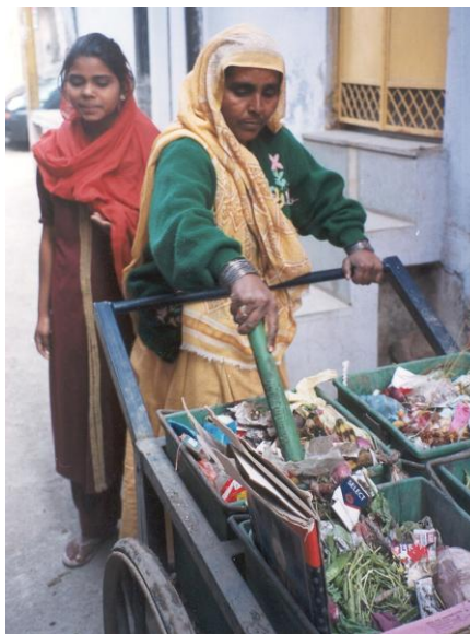
Photo 1: Door-to-door solid waste collector in Delhi

Waste is generated by a range of stakeholders including: pedestrians, households, businesses, markets, industries and healthcare facilities. Therefore solid waste can also include toxic waste (e.g. chemicals from industry), biological waste (e.g. dressings from hospitals) and occasionally faeces (e.g. from nappies). These hazardous wastes require specialised treatment and disposal, not discussed in this technical brief. The source of waste often determines its quantities and characteristics. In developing countries waste generated from various sources is often combined at collection and disposal, so due care must always be taken to ensure the health and safety of those involved in waste management.